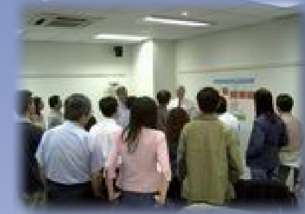
Exam Workshop in Hong Kong.